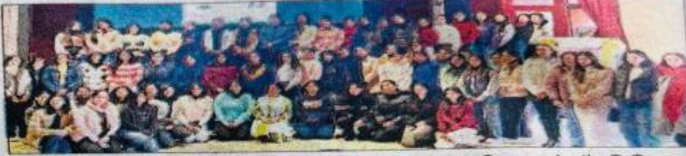
सेंट बीइस कॉलेज में आयोजित कार्यशाला में भाग लेती छात्राएं और विभिन्न स्पर्धाओं की विजेता शिक्षकों के साथ।